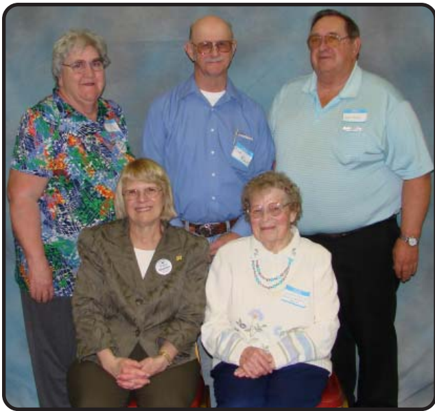
Camp Douglas Senior Band