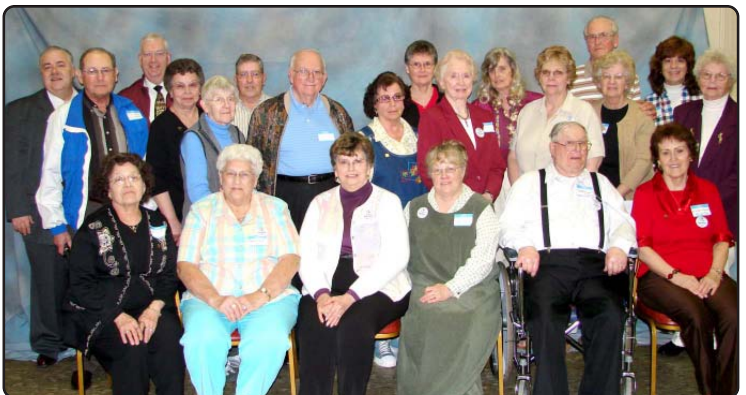
Individual volunteers from all Mile Bluff facilities