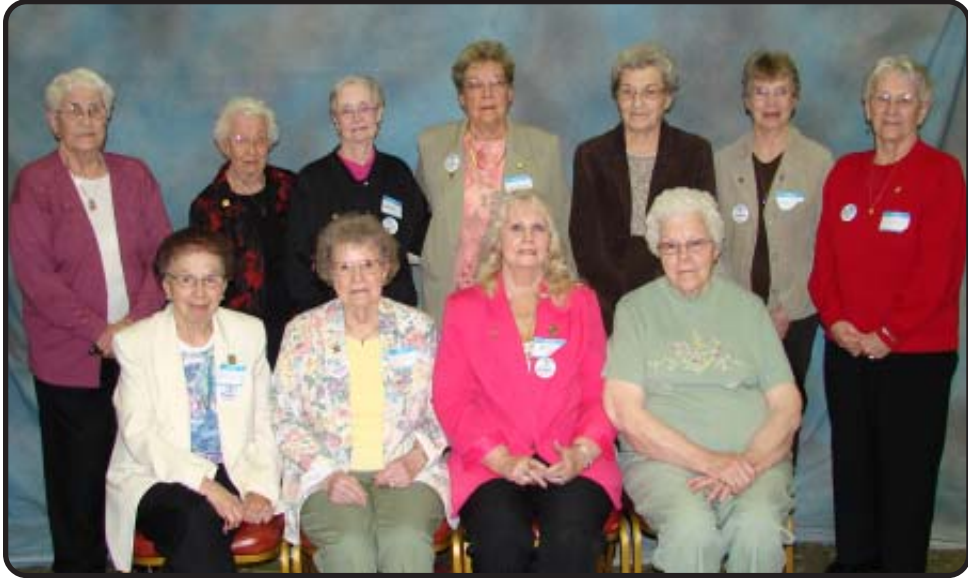
Hess Memorial Hospital Auxiliary