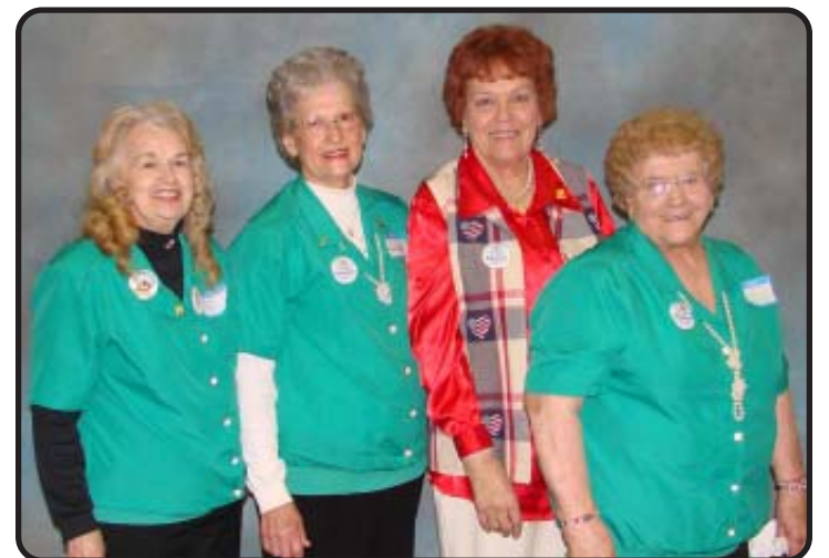
The Golden Girls and Harmony Express