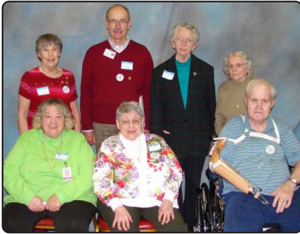
Volunteers who donated over 100 hours in 2007