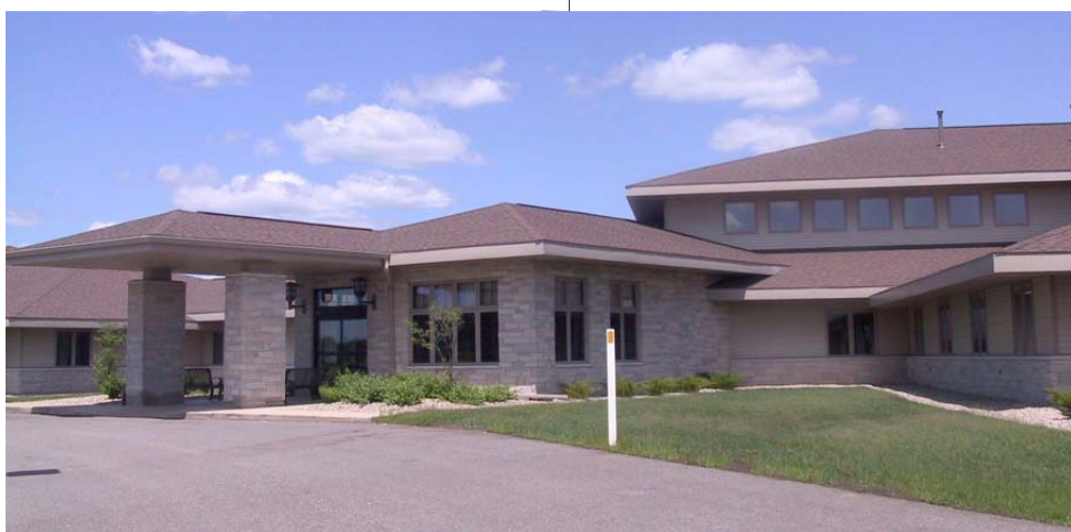
Mile Bluff's Crest View Great Lakes CBRF assisted living facility is located on View Street in New Lisbon and is now accepting new residents.